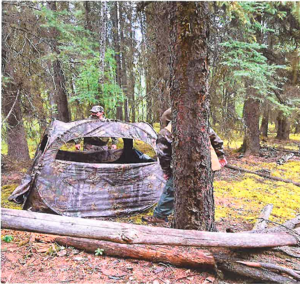
PHELAN at hunting site

52. The hunting area was located to the east of Quartz Lake Campground with in approximately 5 nautical miles of the campground. The hunting area was accessed by PHELAN's Jeep and then a short walk.