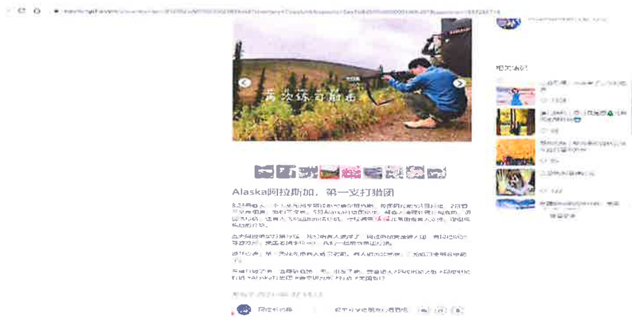
Subject WANG holding aiming a rifle