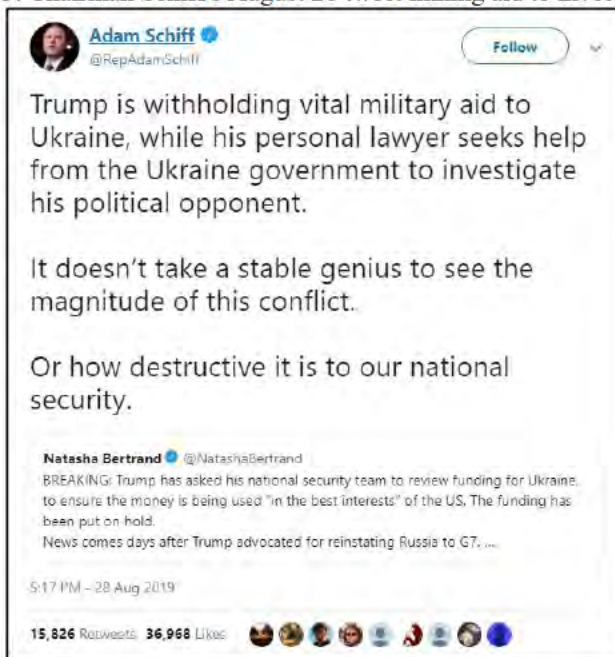
Figure 3: Chairman Schiff's August 28 tweet linking aid to investigations